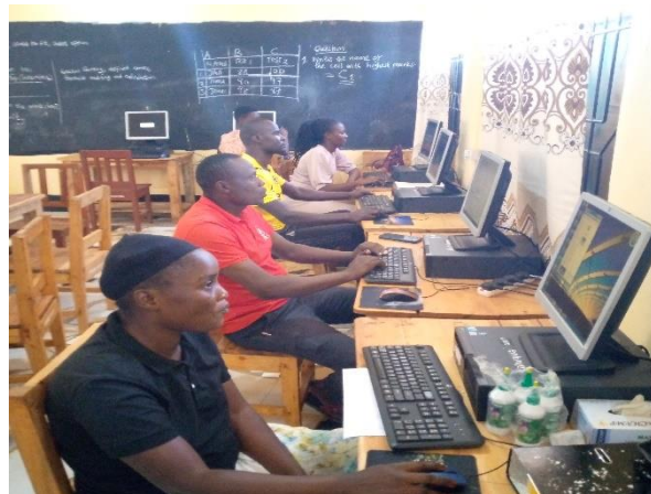
Computer Training session

The room can accommodate more computers to enable more learners to be trained, for the safety of Computers and comfort for the learners the computer Lab needs two air conditions to control heat in the room.